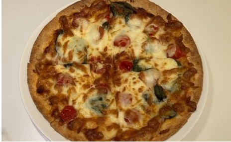
Miso Margherita Pizza