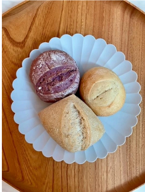
Assorted Japanese Breads