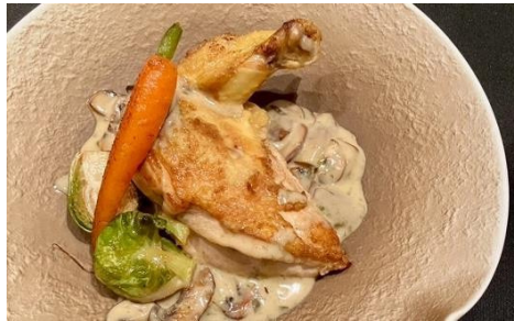
Roasted Freach Chicken