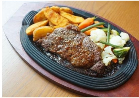
Australian Beef Sirloin Steak