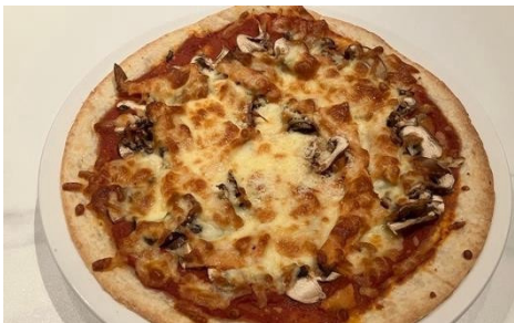
Mushroom & Bacon Pizza